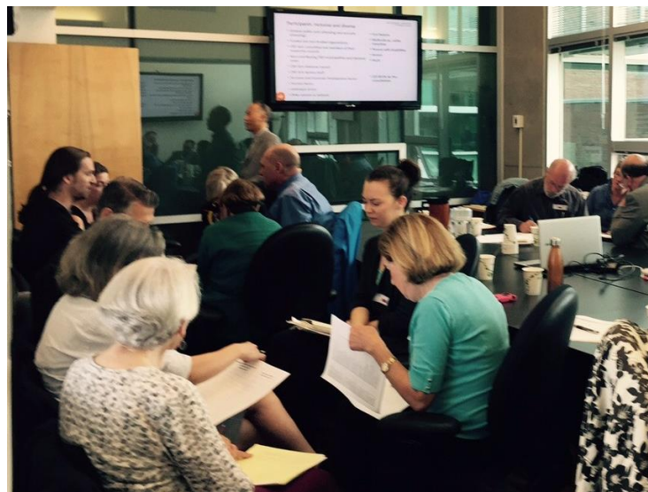
PRE-CONSULTATION SESSION, JUNE 2016