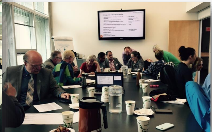
PRE-CONSULTATION SESSIONS, JUNE 2016